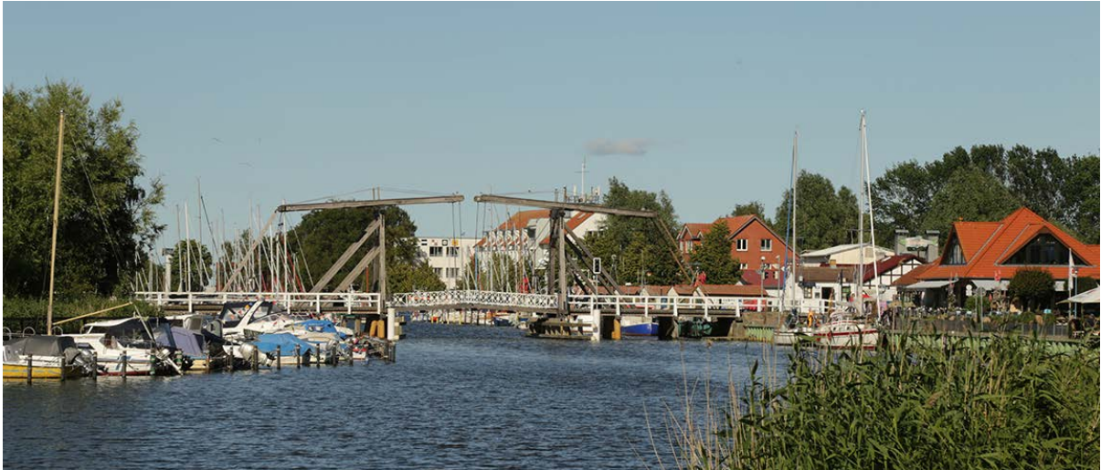
Greifswald-Wieck: Terminal bus station "Wieck-Brücke" of bus "Line 2" is at the right. The hostel "Maritimes Jugenddorf Wieck" ("Majuwi") is situated behind the counterpoise bridge.