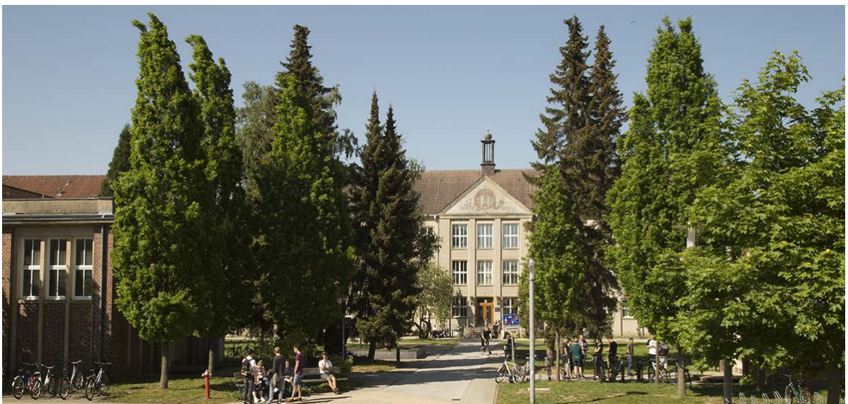
Institute of Geography and Geology: Courtyard of the Greifswald University at Jahn-Strasse 17a. Venue of the Peribaltic Working-Group Meeting 2019 and location of the conference party.