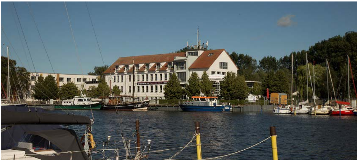
Greifswald-Wieck: Hostel "Majuwi" as seen from the northern side of the river Ryck. Our accommodation facility in Greifswald and the location of the ice breaker party.